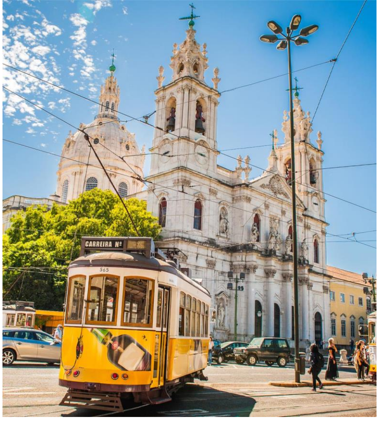
15 Days • 20 Meals: 13 Breakfasts, 2 Lunches, 5 Dinners

HIGHLIGHTS... Barcelona, La Sagrada Familia, Valencia, Paella Experience, Granada, The Alhambra, Seville, Choice on Tour: Seville Walking Tour or Guadalquivir River Boat Ride, Flamenco Show, Cordoba, Madrid, The Prado Museum, Toledo, Elvas, Lisbon, Belém, Obidos