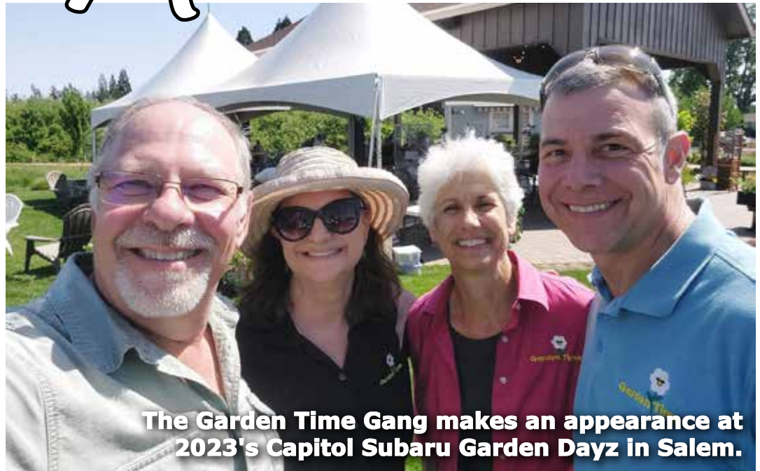
The Garden Time Gang makes an appearance at 2023's Capitol Subaru Garden Dayz in Salem.