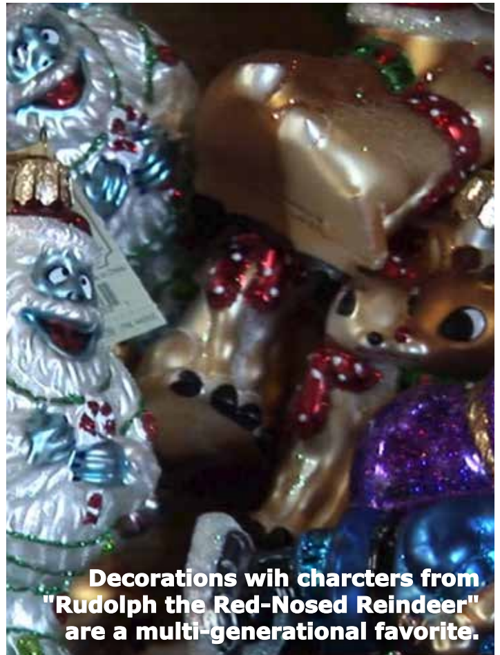
Decorations with characters from "Rudolph the Red-Nosed Reindeer" are a multi-generational favorite.

and hanging out in the garden, too. We saw a birdhouse and paints that allow your kids to be creative and a 'Grow-A-Maze'. This last gift lets your kids plant a seed and then they can watch as the seed grows through a maze to reach the top and stretch for the sun.