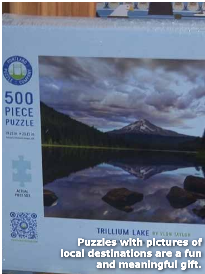
Puzzles with pictures of local destinations are a fun and meaningful gift.

you the mason bees in spring when it warms up.