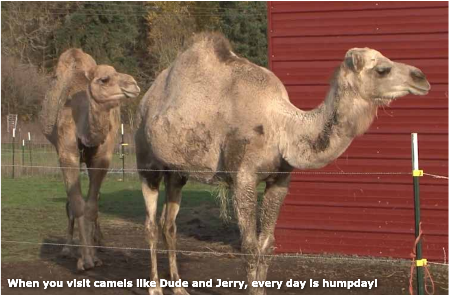
When you visit camels like Dude and Jerry, every day is humpday!