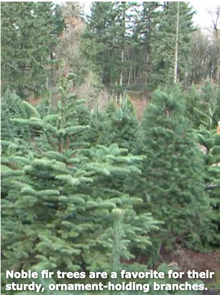
Noble fir trees are a favorite for their sturdy, ornament-holding branches.