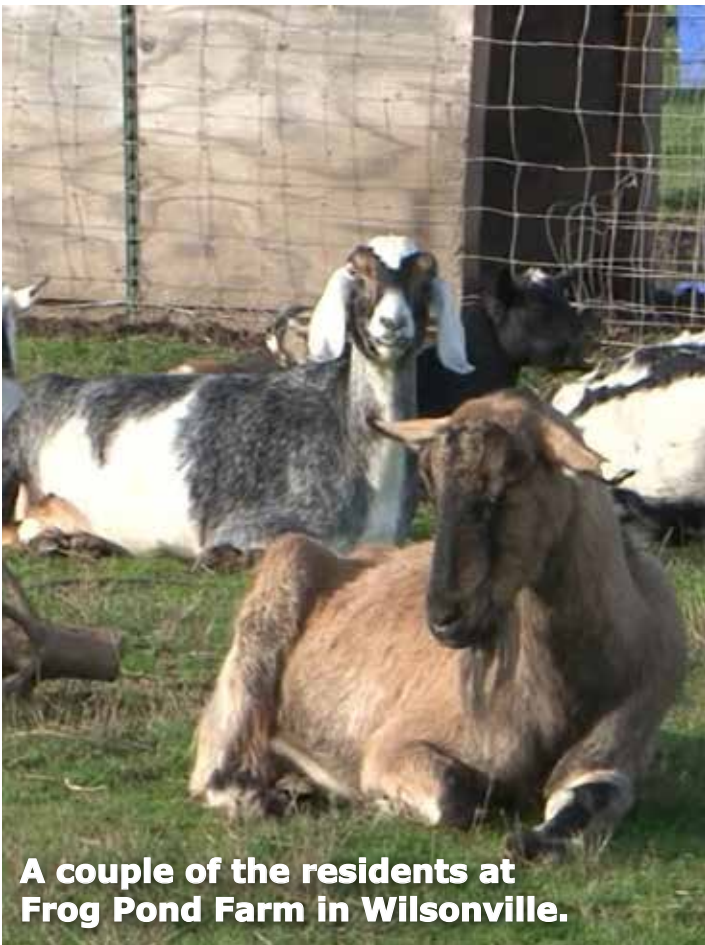
A couple of the residents at Frog Pond Farm in Wilsonville.

your tree will help prevent it from drying out and becoming a fire hazard.