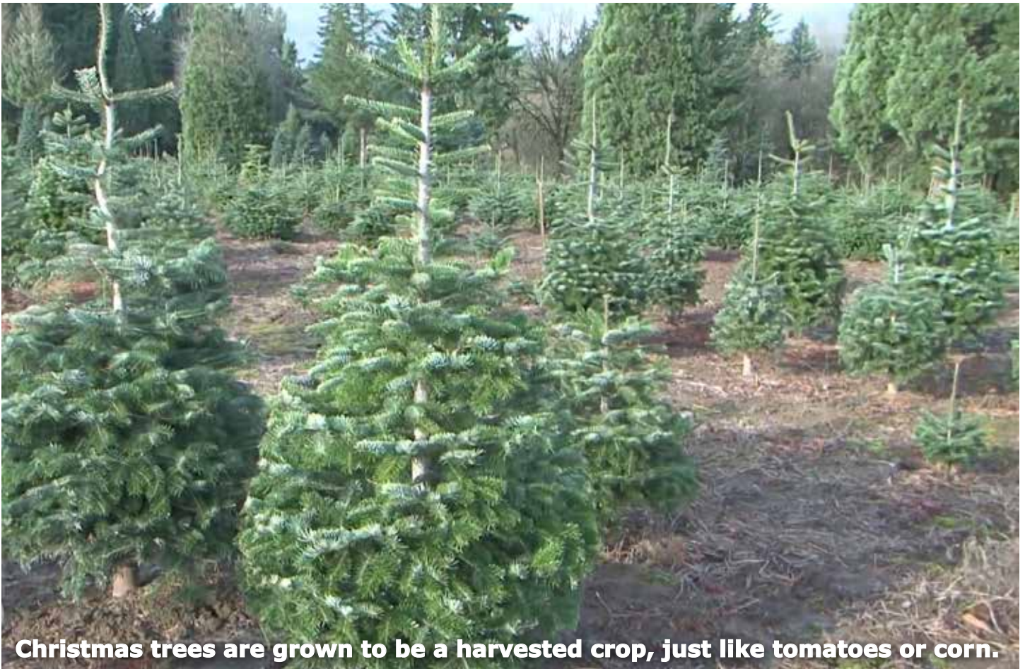
Christmas trees are grown to be a harvested crop, just like tomatoes or corn.