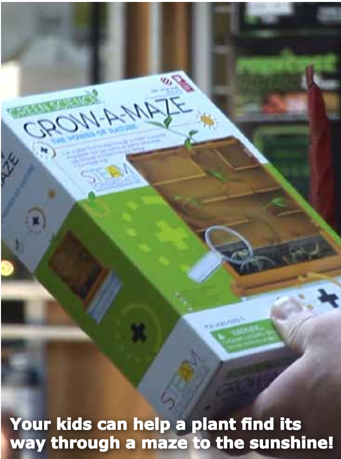
Your kids can help a plant find its way through a maze to the sunshine!