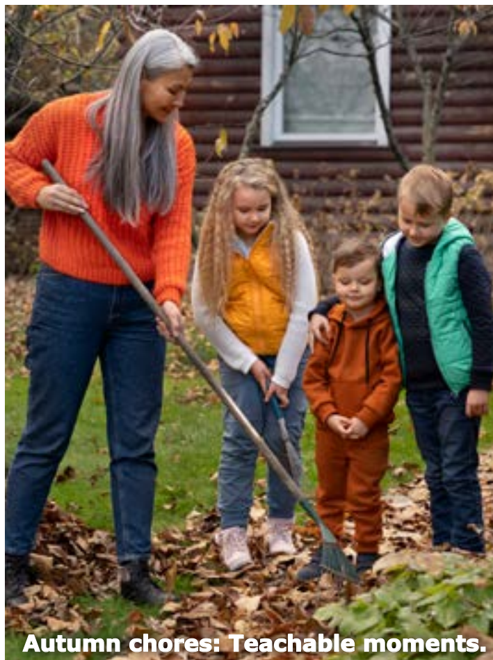
Autumn chores: Teachable moments.