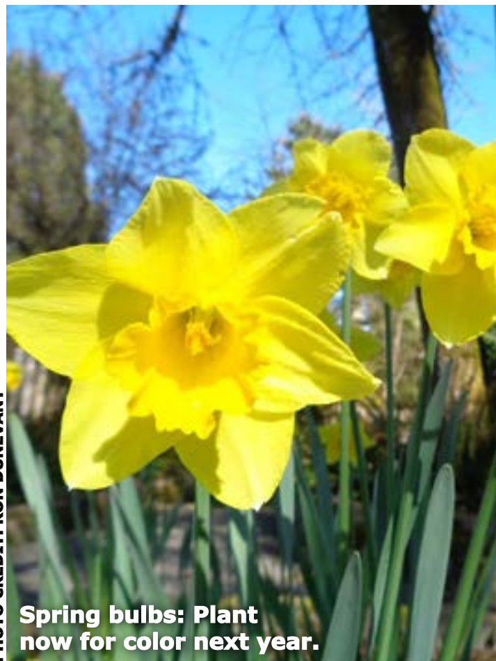
Spring bulbs: Plant now for color next year.

Join us in October as we bring you two brand new Garden Time podcasts!