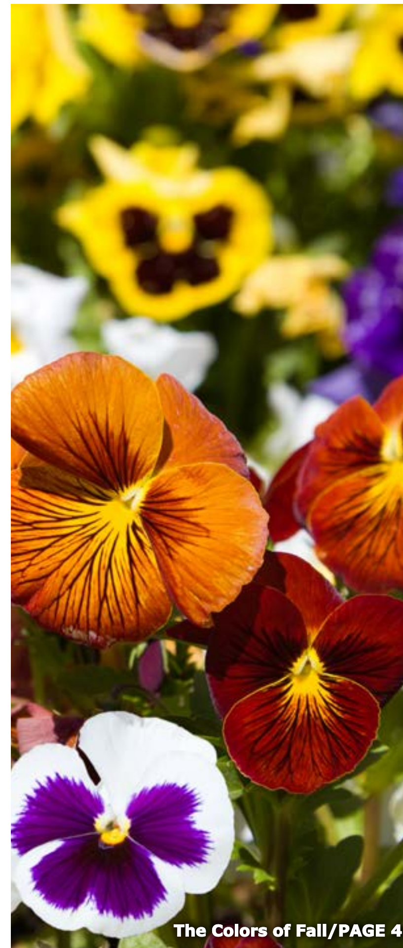
The Colors of Fall/PAGE 4