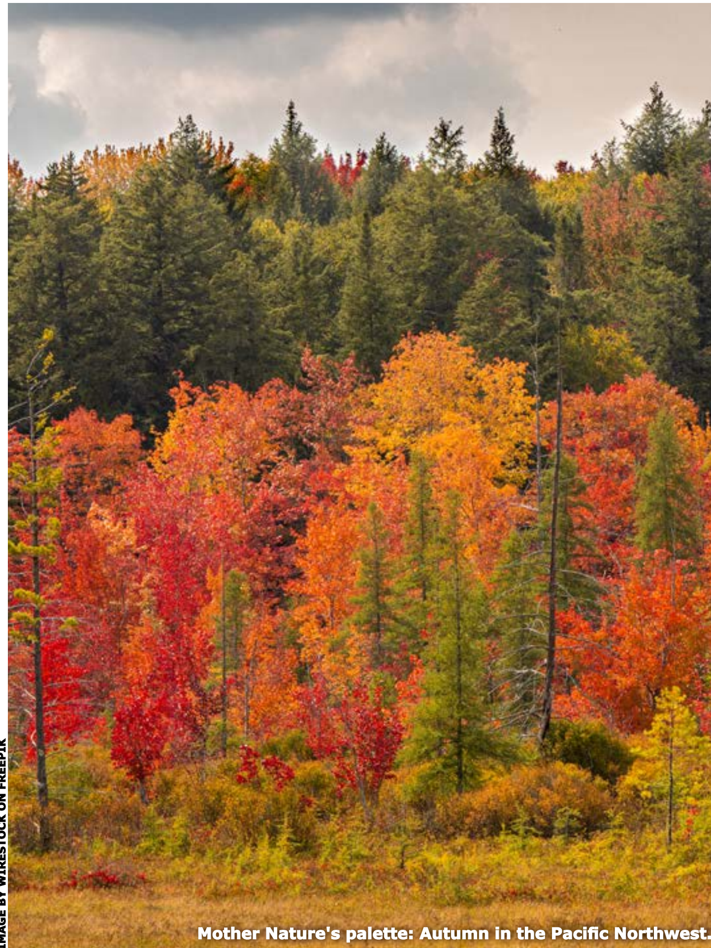
Mother Nature's palette: Autumn in the Pacific Northwest.