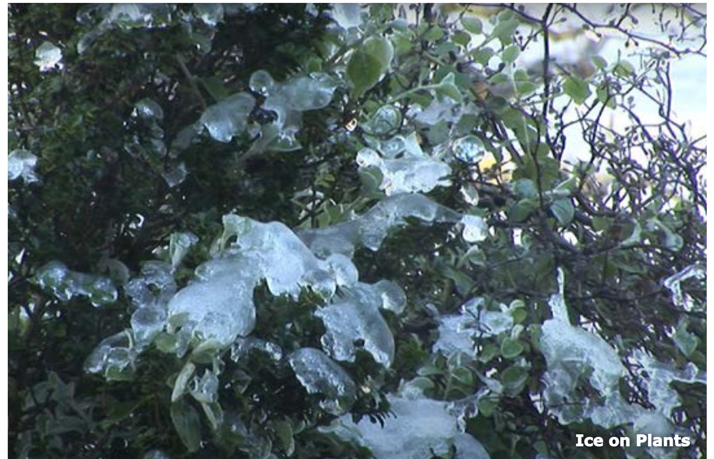
Ice on Plants

We then moved to pests. You may see them inside your home during the winter. They are just like us and are looking for a warm and dry place for a few months. Seeing them indoors also may mean that they are outside in your garden too. There are a few things you can do now to reduce your pest