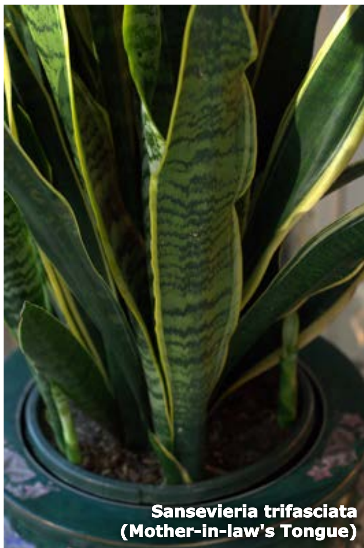
Sansevieria trifasciata (Mother-in-law's Tongue)

Check our website regularly for the premieres of these topical and thought-provoking January podcasts.