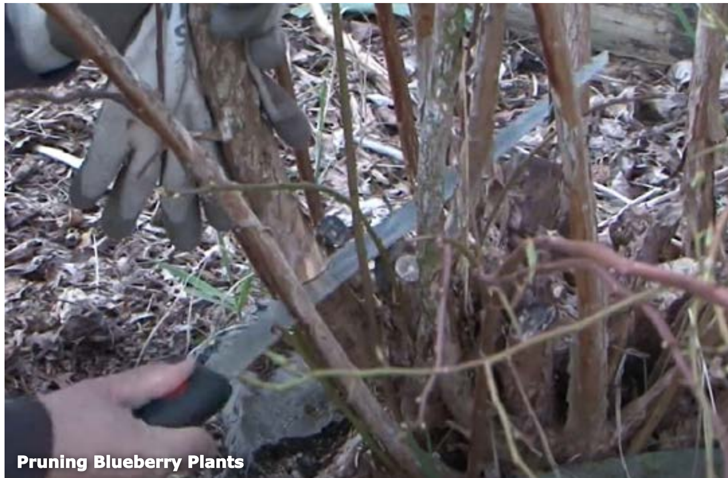
Pruning Blueberry Plants

mature at the end of the branches creating weight problems and possible damage to the tree. What makes pruning easier is knowing the difference between a leaf spur and a fruiting spur. A fruiting spur looks like it has a wrinkled collar where it attaches to the tree.