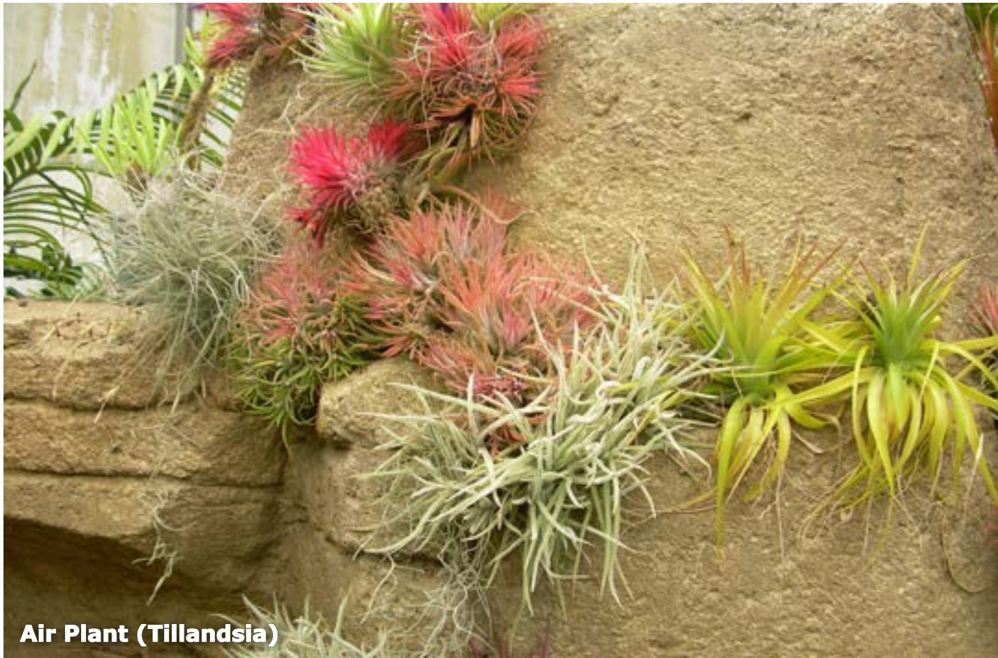
Air Plant (Tillandsia)

every week. A lot of people will wait for the fleshy leaves to just start to shrivel and then they will soak their plant well and let it drain, then it is good for another few months or so. This was the medicinal Aloe. So if you get a burn or scrape, you can snap off a leaf and rub it on your skin to help with healing.