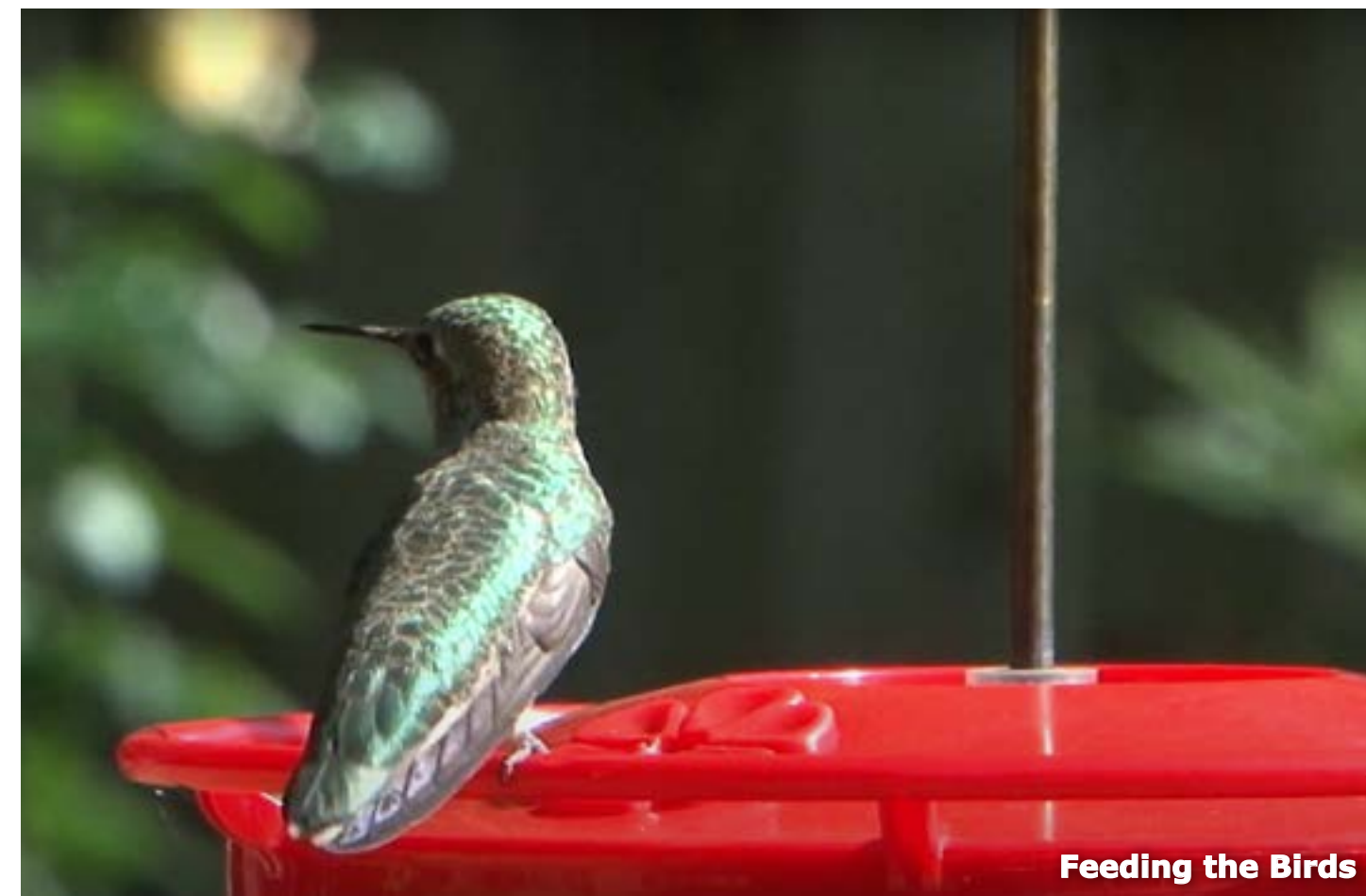
Feeding the Birds

The change of the seasons also signals a change for your local bird populations. Some of the non-migratory birds will be hanging around and may need a little help from you to survive the cold and wet of winter. We started with food. For seed eating birds you can use a black oil sunflower seed. This is a good basic seed that provides calories for high energy birds. For insect feeders you can set out a suet cake. Use different types of suet to attract different types of insect feeders. For most suet feeding birds, they love insects and if you see a suet block with seed it is generally used as a filler in the suet. Once you have their food needs met, then you need to think about water. You may want to take a look at heaters to keep their water from freezing. You should also remember to put out fresh water whenever you can, since the birds prefer that over standing, dirty, water. The one bird that has special needs in the winter is the hummingbird. They use lots of calories and so their food needs are more critical than oth-