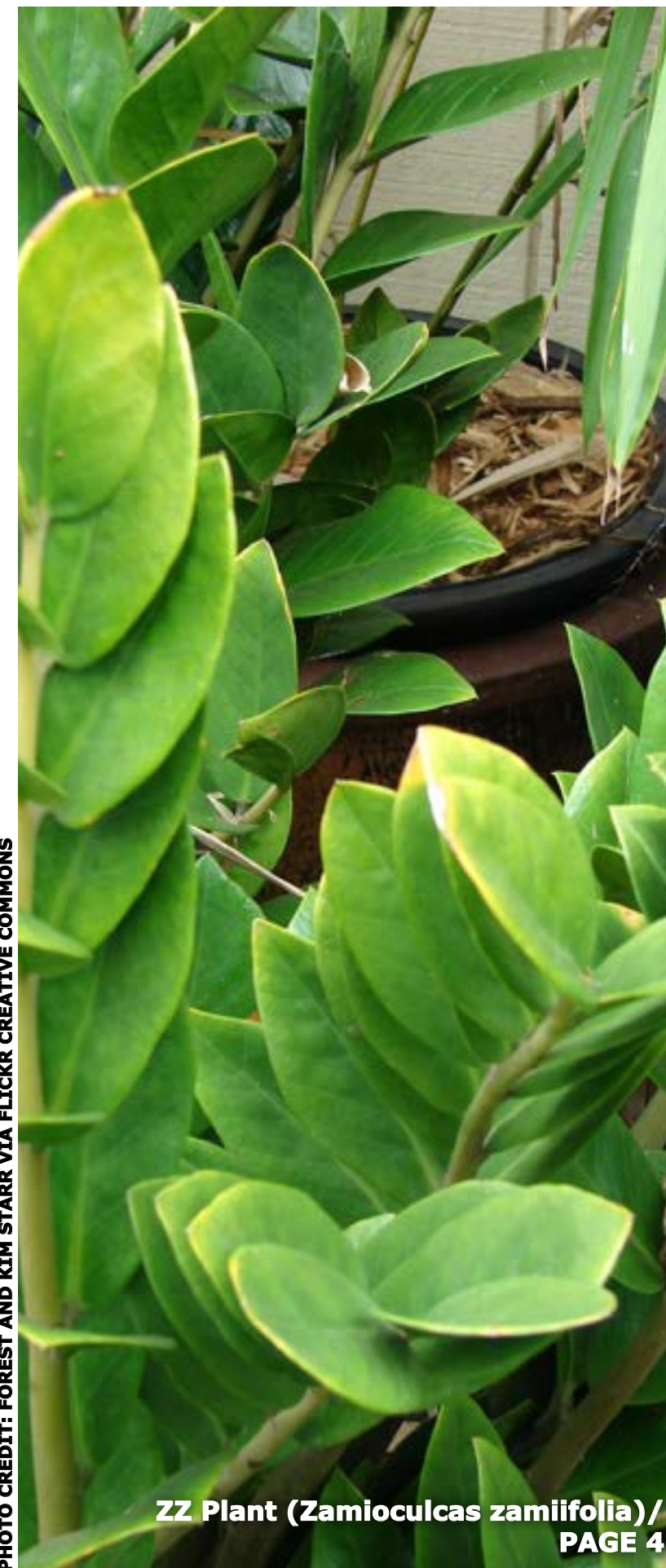
ZZ Plant (Zamioculcas zamiifolia) / PAGE 4