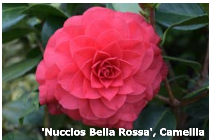
'Nuccios Bella Rossa', Camellia