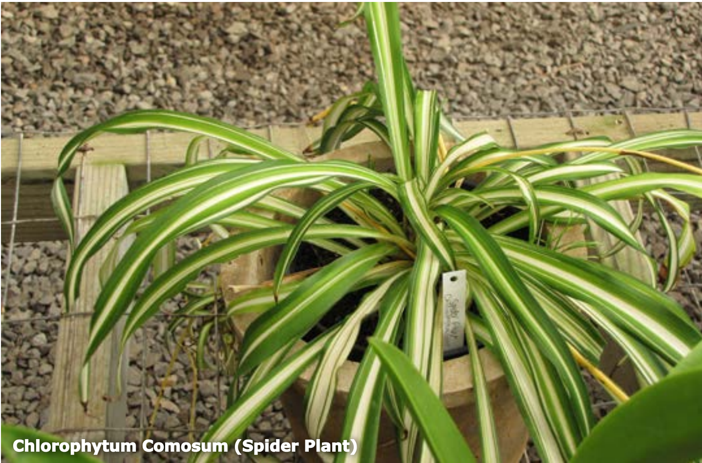
Chlorophytum Comosum (Spider Plant)

times. This variety is often seen in the lobbies of hotels because it is so resilient and tough, it will just keep on growing. The name is due to the lady-like finger fronds that keep on coming up from the base to a height of 6 feet in your home, larger in larger spaces. Most palms will not grow when you cut the tops down, but this one keeps going because it sends up new canes from the base, making it a perfect plant for the home gardener. If you are looking for a larger indoor plant, the Natal Mahogany is the one for you. Though it can grow over 40 feet tall in nature and in full sun, it can handle the low light situations of the home much better than most plants. It will respond well to pruning, too. If you want it to stay at six feet, you just prune it to six feet and it will continue to thrive.